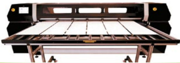
HP Scitex FB950

flatbed, sheet-fed and roll fed. 8' wide to unlimited length, up to 2.5" thick. print on virtually anything!