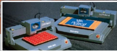
acrylic engraving, one of our many new offerings in 2012. inset: one of our new technologies, Engraving Machinery